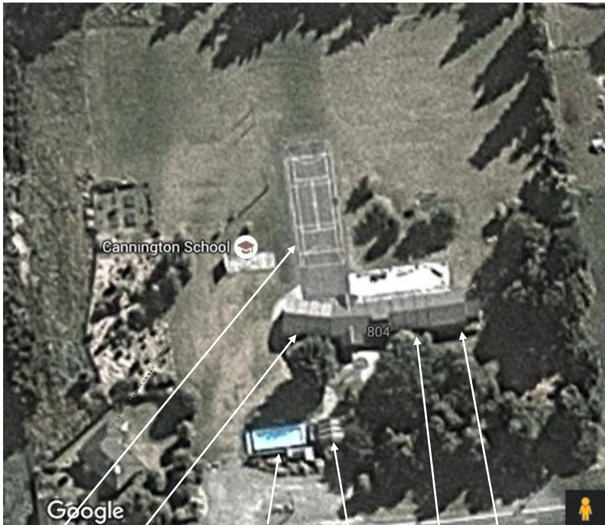
Tennis Court Room 1 Swimming Pool Garage Room 2 Library